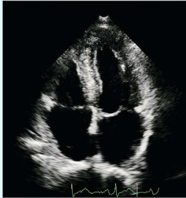
2-dimensional echocardiographic view of the heart showing the 4 chambers