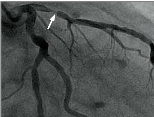
Shows blocked artery

After the catheter placement and filming, which normally takes about 15 to 30 minutes, the catheters will be removed. Upon removal, the doctor will discuss his findings with you. If necessary and you are agreeable, he may proceed directly to coronary angioplasty.